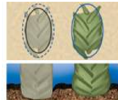
Low Soil Compaction