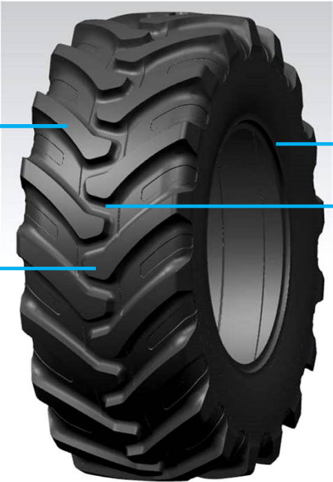
460/70R24 IND R-4

★ Lower Wear : Big lugs on the center ,improve tire contact areas, reduce the tread crown wear.